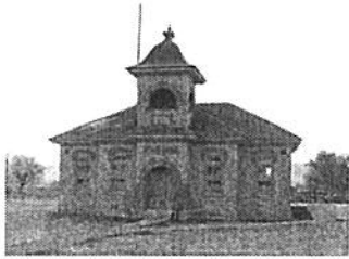
Fairfield School House, 1898