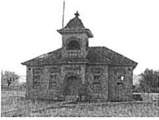
Fairfield School House, 1898